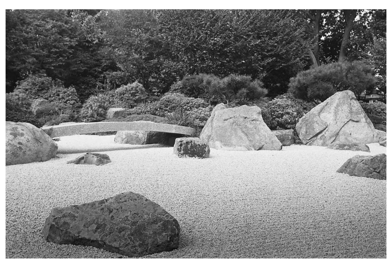
Garden of Heaven and Earth, Museum of Fine Arts, Boston